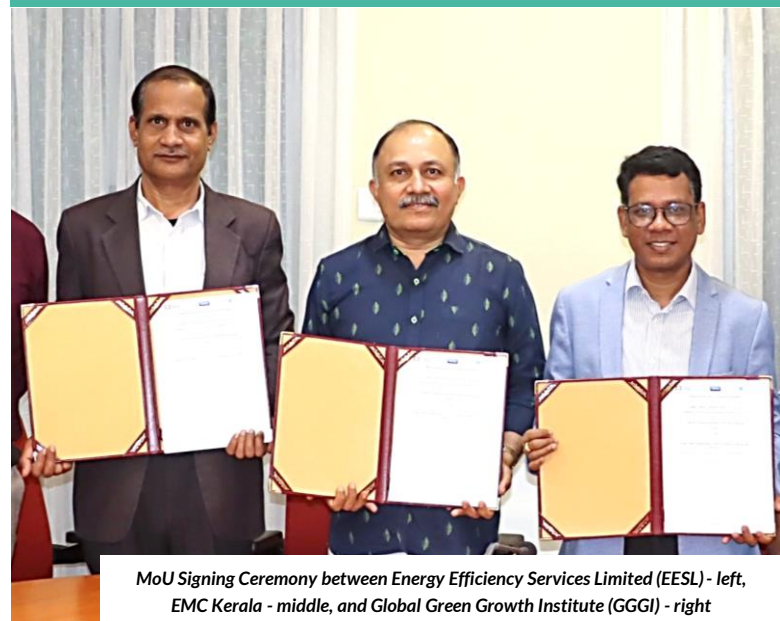
MoU Signing Ceremony between Energy Efficiency Services Limited (EESL) - left, EMC Kerala - middle, and Global Green Growth Institute (GGGI) - right