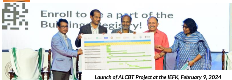
Launch of ALCBT Project at the IEFK, February 9, 2024