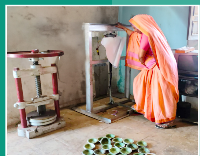
Donna Pattal Units

Under the forest NTFP value-added chain, the team facilitated the establishment of a Dona Pattal Working Unit, establishing two Dona Pattal making units, one in each bank. Preceding this, thorough training on safety precautions and machine operation was imparted to unit members. The units are fully functional, producing good quality Donas (Leaf made Bowls) and Pattal (Leaf made plates), since these plates are experiencing high demand in the area, it is expected that these units will be sustained in the future and provide a substantial livelihood to the communities, especially women.