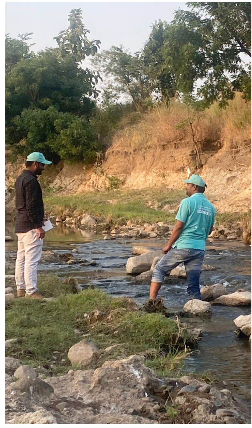
Comprehensive Water Evaluation under NLRP