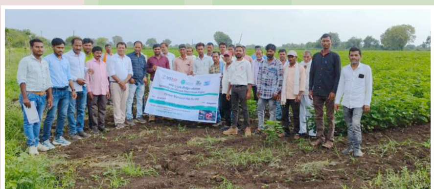
Farmer Producer Organisations in the process