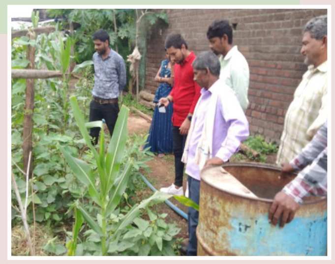
Exposure visit to Bio-Resource Centers