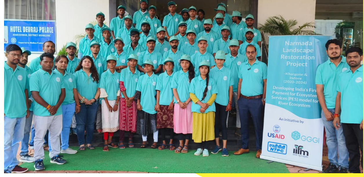
Empowering Youth through Youth Cadre Workshop