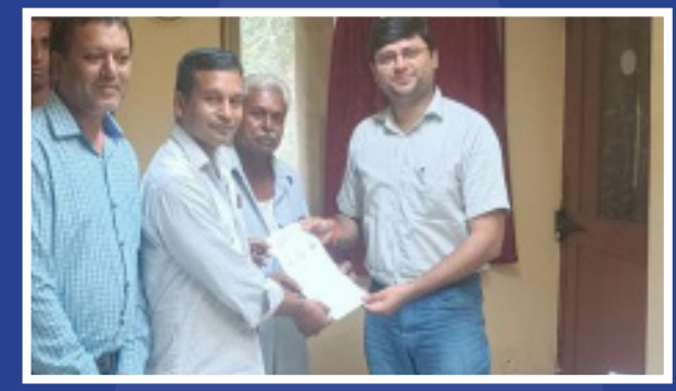
Tripartite Agreement with Barwaha Forest Division, JFMCs and SPS

advanced, and the initiation of the first payment for forest landscape restoration is scheduled to commence in 2024. The team has identified all on-ground activities and is ready to begin implementation as soon as the payment processing request gets initiated by the JFMC.