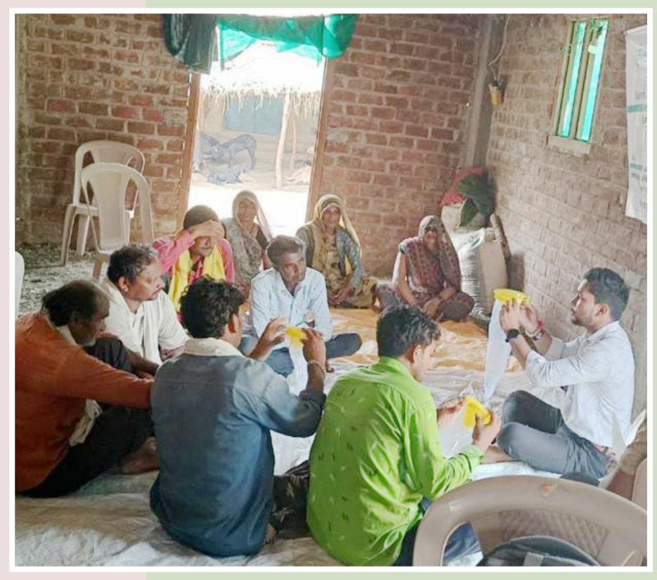
Demonstration of Yellow Sticky Traps

Regular Farmer Interest Groups (FIG) meetings are systematically organized every quarter, providing a crucial platform for farmers practicing sustainable organic agriculture. These meetings serve as channels for discussions, learning sessions, and the implementation of sustainable practices tailored to the specific needs and knowledge requirements of the farmers. In July, FIG meetings were successfully conducted in all 19 villages. The team has proactively shared a revised schedule to conclude all FIG meetings by January 13, 2024. Notably, in this quarter, the team has already conducted comprehensive meetings in several villages, including Pipalgone, Bhagyapur, Khamlay, Jhirbar, Jamniya, Julwaniya, Arsi, and Dhabad. The commitment to these regular interactions underscores the project's dedication to continuous learning, knowledge dissemination, and the ongoing support of farmers in adopting sustainable agricultural methods.