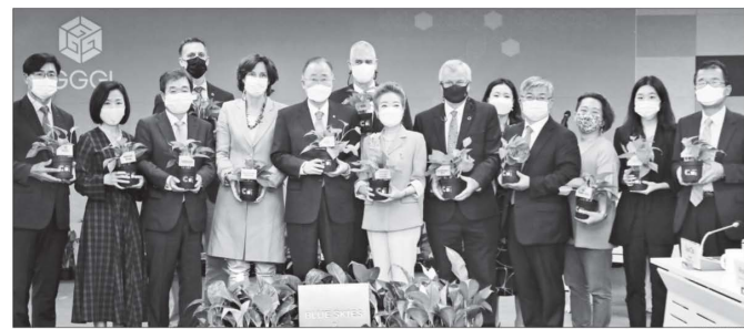
Climate leaders meet in Seoul, urge global cooperation

BY ESTHER CHUNG [chung.juhee@joongang.co.kr]