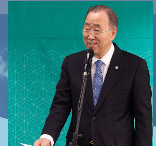
Mr. Ban Ki-moon President and Chair of GGGI

We need to build stronger public awareness of both air pollution and climate crises and demonstrate support for ambitious, bold action to tackle these crises. Active collaboration among government agencies, embassies, civil society groups, and international organizations are key to reducing air pollution and tackling climate change."