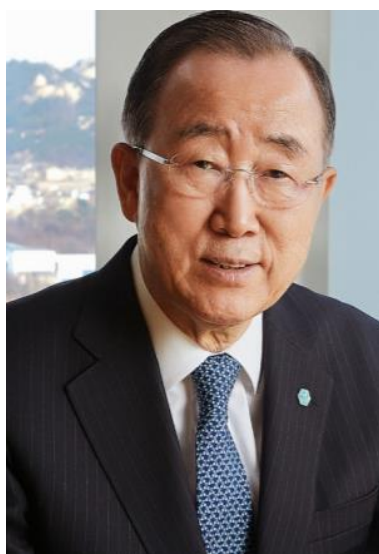
H.E. Ban Ki-moon

President of the Assembly and Chair of the Council, GGGI