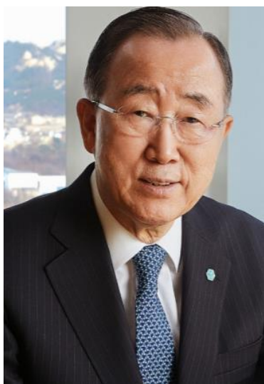
H.E. Ban Ki-moon

President of the Assembly and Chair of the Council of the Global Green Growth Institute (GGGI)