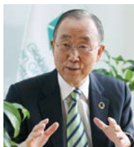
Mr. Ban Ki-moon President of the Assembly & Chair of the Council and 8th Secretary-General of the United Nations