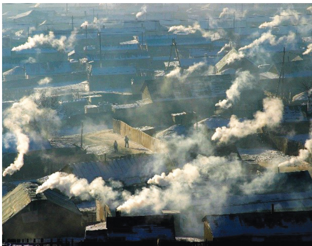
Figure 4: Air pollution in Ulaanbaatar

The Action Plan of the Government of Mongolia (GoM) for 2016-2020 has set solid commitments on comprehensive measures to reduce air pollution with objective “to reduce air, water and soil pollution and implement appropriate waste management in cities and other urban areas”. According to the National Action Program for Reducing Air and Environmental Pollution (NAPRAEP), household coal stoves (210 thousand) and 3200 Heat Only Boilers (HOB) in ger districts of Ulaanbaatar city account for 80 percent of the urban air pollution. Approximately 400,000 vehicles emit about 10 percent of the urban air pollution and power plants are responsible for other 6 percent. About 4 percent of the urban pollution comes from dust, waste, soil and other sources.