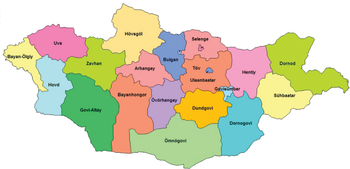
Figure 1: Administrative Map of Mongolia by GGGI Consultant

Bulgan city in Bulgan aimag is located in 330 km from Ulaanbaatar city. The city is home for 12,400 people. Annual consumption of coal for district heating system is 10,200 tons, with GHG emission of 14,500 CO 2 e. Current heating system includes 6 medium-sized HOBs and 130 low-pressure HOBs and privately-owned heating network system. Total existing heat load of Bulgan city was 13.6 MW in 2015. A district heating power plant of 28MW, constructed in 2014, has not been commissioned yet due to absence of thermal substation, and water circuit, in addition to uncertainties around the ownership and management.