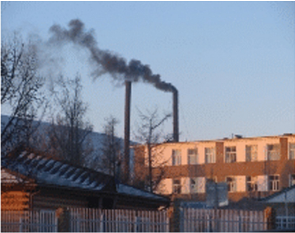
Figure 3: Tsetserleg city, 26 January 2016

Tsetserleg city in Arkhangai aimag is home for 21,000 people. The heating system is consisted of coal-fired 10 boilers, with very low efficiency of 55-60 percent, 40 low pressure HOBs, and privately owned heating network that provide space heating only. Hot water is supplied from household electric water boilers mainly. Total existing heat load of Tsetserleg city was 10.34 MW in 2015. Its annual coal consumption of the district heating system is 11,500 tons that emits GHG emissions of 16,000 CO 2 eq.