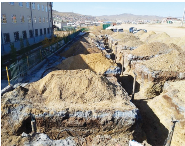
Figure 5: Installation of Ground Source Heat Pump of 122nd Public School of Ulaanbaatar city, October 5, 2019.

As a result of regular consultation and engagement with the Ministry of Environment and Tourism (MET), the business case study was piloted and commissioned in 2019. Under the framework of NAPRAEP, total allocated state budget for the pilot project was MNT 720 million (US$250 thousand).