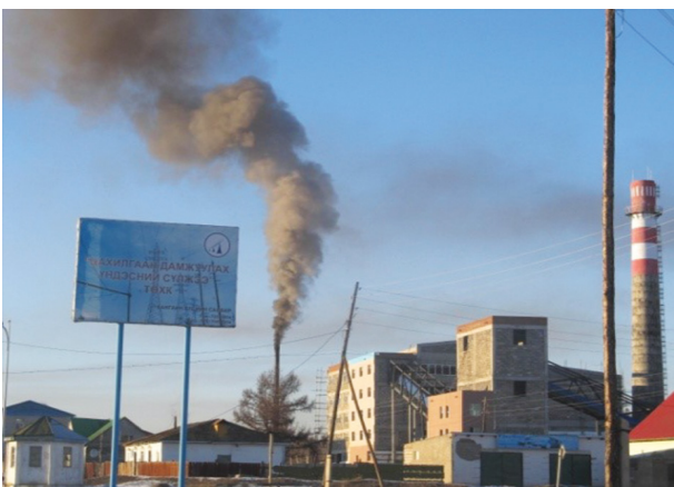
Figure 2: Bulgan city, 28 January 2016.