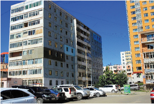
Figure 6: Common Multi-Family Apartment Block, 2019.

GGGI is currently seeking to attract financing for the implementation of Thermo-Technical Retrofitting (TTR) of the residential buildings in UB city from Nationally Adapted Mitigation Actions Facility (NAMA). Concept note for “Mongolia – Energy Performance Contracting for Residential Retrofitting in Ulaanbaatar City” was selected for the phase of detailed project proposal development by NAMA in 2019. The proposal will be completed and submitted to the NAMA in 2021. It will be addressing main challenges in country such as availability of financial resources, capacity gaps in private sector and stakeholders and increasing public awareness on benefits of TTR. Also, it will be using NAMA funds as a leverage to mobilize additional