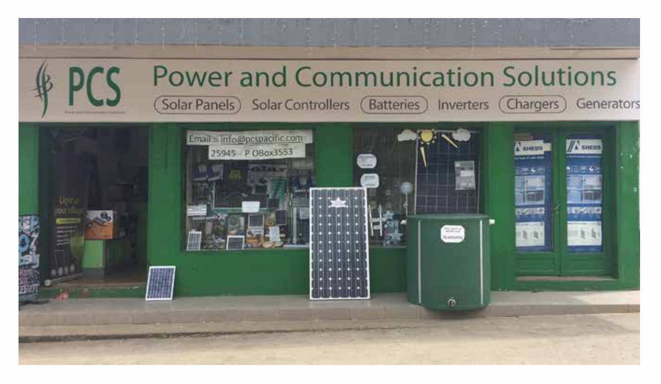
PCS's shop in Port Vila offers a variety of solar products for sale<sup>20</sup>

PCS<sup>12</sup> is an alternative energy company that provides solar-powered solutions for communities, businesses, and residential customers.