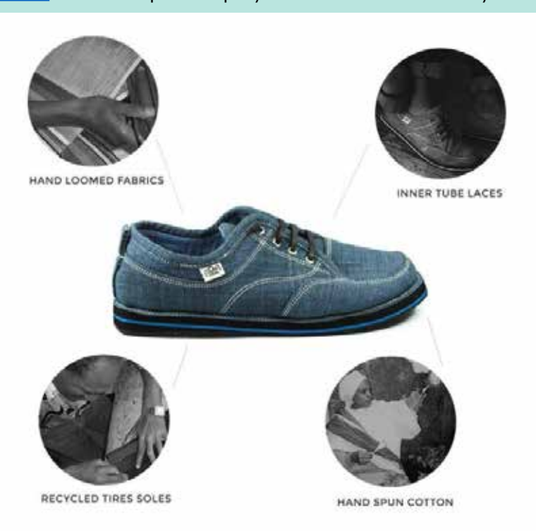
Sole Rebels manufactures shoes from recycled products and describes itself as "Green by Heritage"28

Sole Rebels<sup>27</sup> is an Ethiopian company that makes shoes from recycled materials.