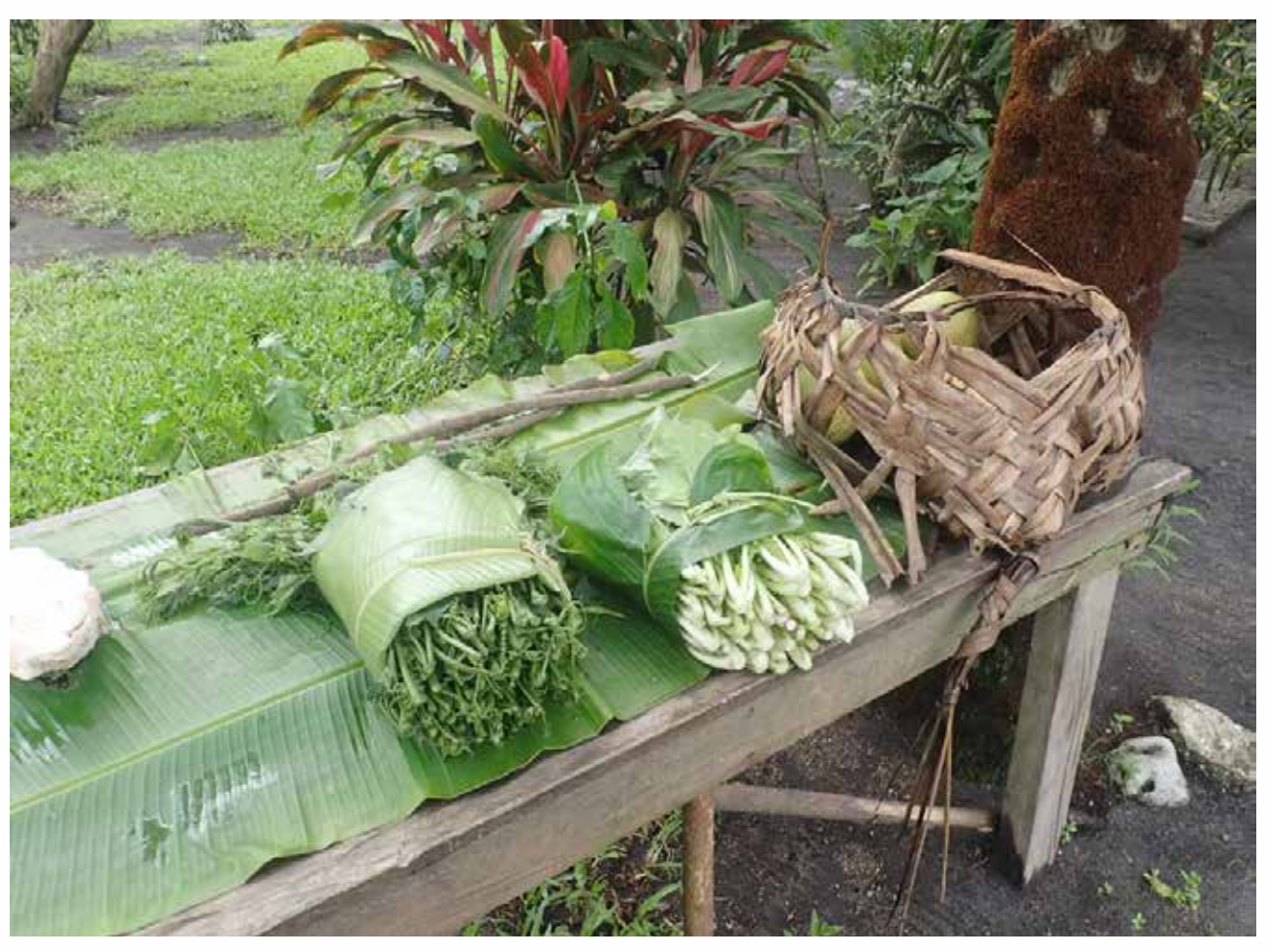
Replacing packaging with locally-sourced biodegradable material can reduce the volume of non-biodegradable waste and provide income-generating opportunities locally

As Vanuatu has become increasingly part of the global system, people have shifted away from using local resources to being dependent on mono-cropping in agricultural systems, and to using imported goods such as plastics from around the world for packaging and decoration. A move to a more sustainable economy and society may mean learning from the past, and re-introducing or re-adopting some of Vanuatu's traditional practices.