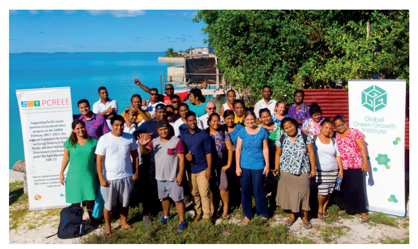
Group photo of participants at the Greenpreneurs Jumpstart your Green Business Workshop in South Tarawa, October 2018

In Kiribati, the Greenpreneurs Jumpstart Your Green Business Workshop was held in October 2018, organised jointly with the Pacific Centre of Excellence for Renewable Energy and Energy Efficiency. Over twenty participants engaged with trainers and local business mentors to learn about trends in agriculture, waste, and low-impact tourism; requirements for starting a business in the country; and examples of existing successful green businesses in Kiribati and the Pacific region. This guide is based on the information covered in the workshop, and aims to assist other potential green entrepreneurs in developing new, innovative green business ideas that will help Kiribati meet its environmental and developmental goals and ensure a clean, prosperous future for the country.