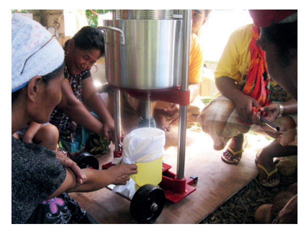
Kiribati Organic Producers making organic products

labourers in their neighbourhood, and developing a glass crushing business is a viable option. These motivational differences mean that the two businesses may make very different strategic decisions. For instance, if the demand for construction material changes so that crushing glass for construction products is no longer viable, Business A may consider repurposing recycled glass into other products, but Business B may decide to stop recycling and crushing glass, and look for other options to employ labourers. In this example, Business A is mainly a green business, while Business B is a social enterprise.