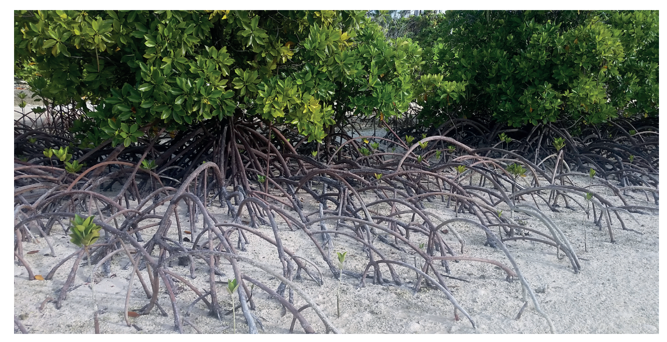
Mangroves play an important role in Kiribati's ecosystems.

Conserving these areas and the biodiversity of the plants and animals that live there is important because these natural resources provide food and support industries including tourism and fisheries. Mangroves, for instance, play a vital role in regulating our climate and water, as carbon sinks, as habitats for important animal species, as sources of medicinal plants, and in stabilising coastlines from erosion.