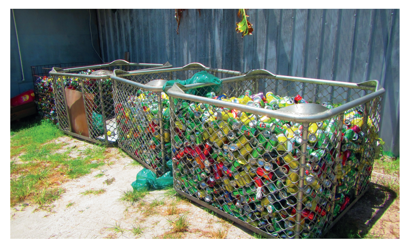
A collection point for the Kaoki Mange recycling initiative

Another way that green businesses can address waste is by creating a more circular economy – that is, by using the waste products of another industry or business as their input. Currently, our society is mostly linear – we use raw materials to make products and then dispose of them at the end of their useful life. This has been described as the "Take – Make – Dispose" economy. To create a more sustainable circular system, green businesses can make new products from existing waste products, reducing overall waste.