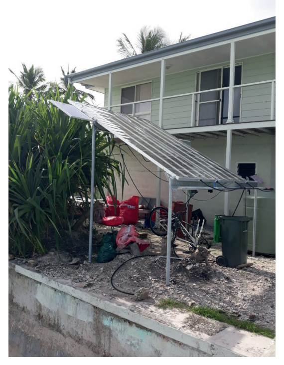
A solar water purification system from Tobaraoi Travel

<u>Tobaraoi Travel</u><sup>13</sup> sells solar water systems that purify water (including brackish water) by using solar energy to evaporate and condense it. This can reduce plastic-bottled water use and help make communities more self-sufficient.