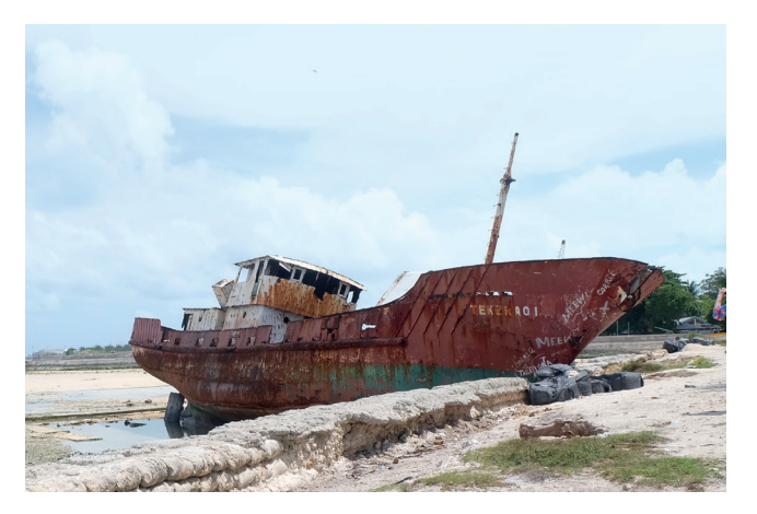
The effects of climate change can already be seen in some areas of Kiribati.

are currently being imported (as importing goods requires the use of fossil fuels to transport them to Kiribati).