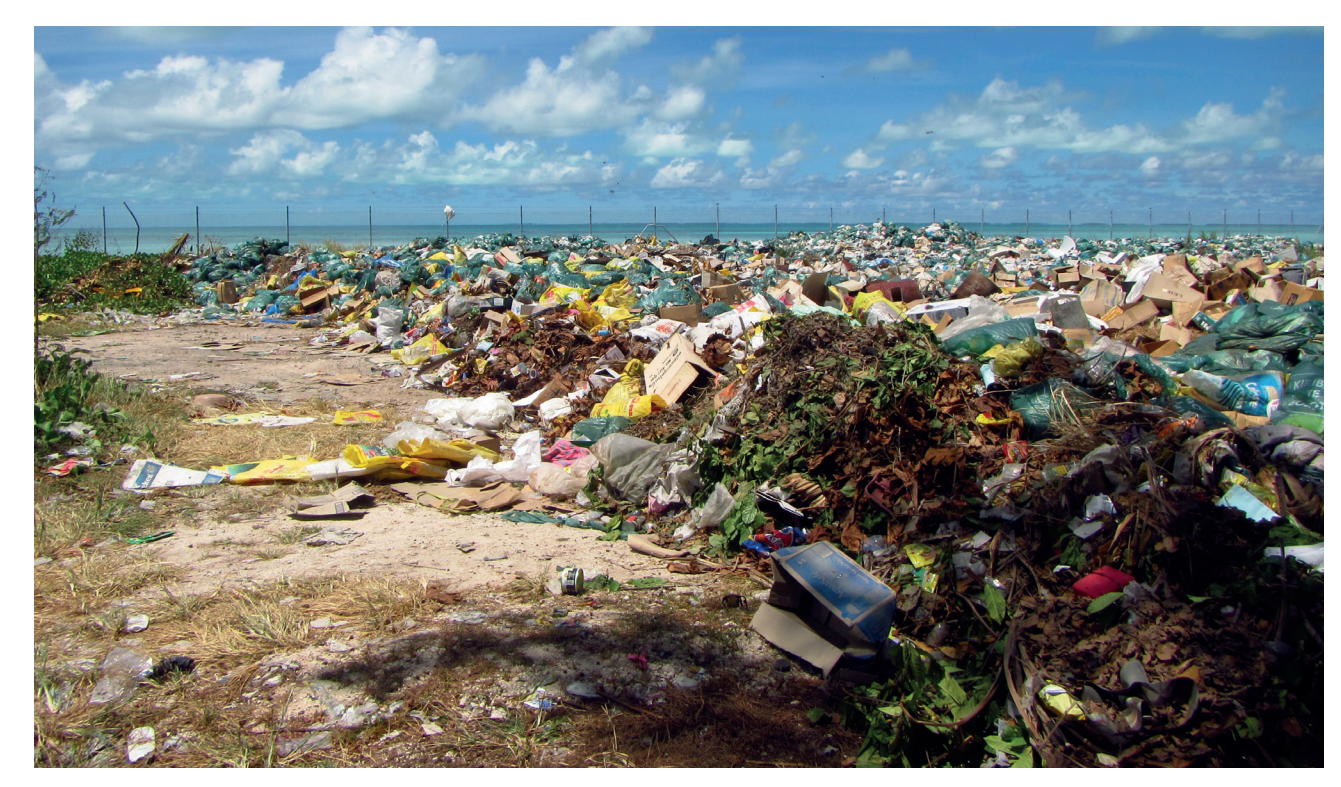
Waste at the landfill site on South Tarawa.