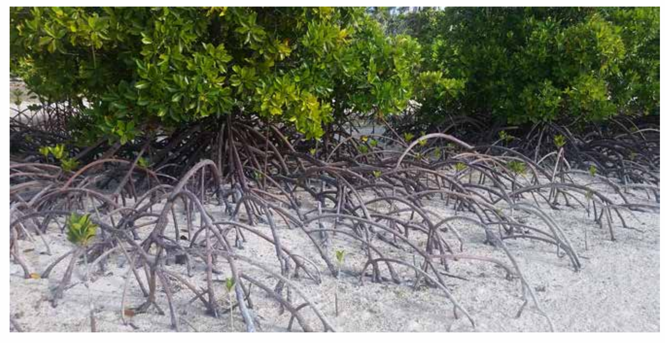
Mangroves play an important role in Kiribati's ecosystems.

Conserving these areas and the biodiversity of the plants and animals that live there is important because these natural resources provide food and support industries including tourism and fisheries. Mangroves, for instance, play a vital role in regulating our climate and water, as carbon sinks, as habitats for important animal species, as sources of medicinal plants, and in stabilising coastlines from erosion.