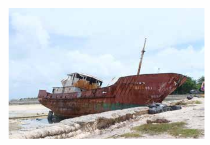
The effects of climate change can already be seen in some areas of Kiribati.

are currently being imported (as importing goods requires the use of fossil fuels to transport them to Kiribati).