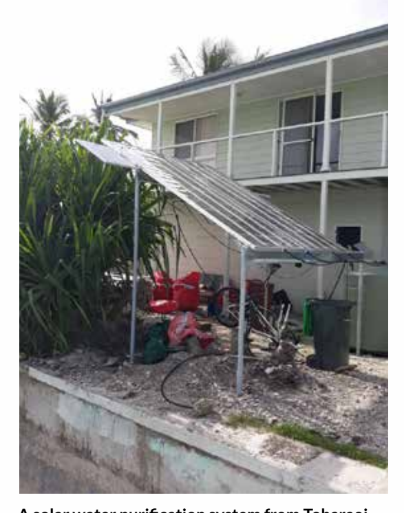
A solar water purification system from Tobaraoi Travel

Tobaraoi Travel<sup>13</sup> sells solar water systems that purify water (including brackish water) by using solar energy to evaporate and condense it. This can reduce plastic-bottled water use and help make communities more self-sufficient.