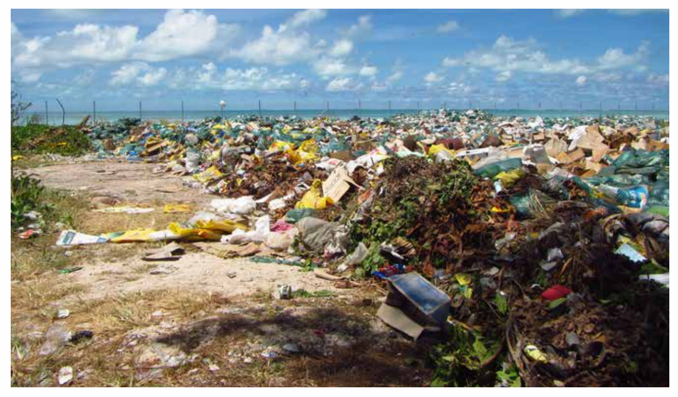
Waste at the landfill site on South Tarawa.