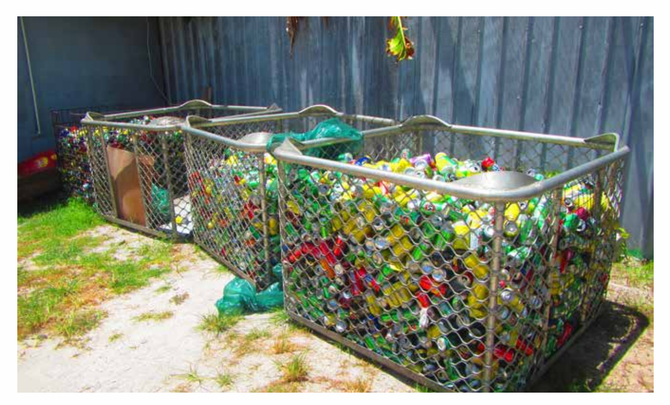
A collection point for the Kaoki Mange recycling initiative

Another way that green businesses can address waste is by creating a more circular economy - that is, by using the waste products of another industry or business as their input. Currently, our society is mostly linear - we use raw materials to make products and then dispose of them at the end of their useful life. This has been described as the "Take - Make - Dispose" economy. To create a more sustainable circular system, green businesses can make new products from existing waste products, reducing overall waste.