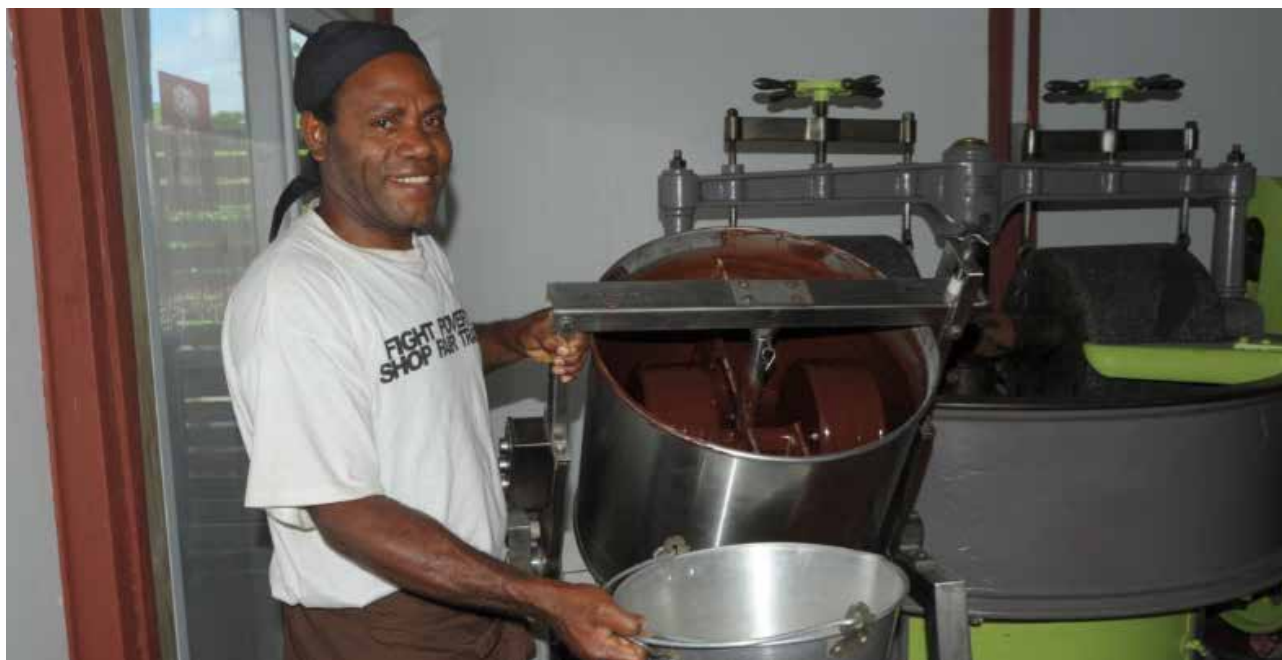
Aelan chocolate makers, owned by the ACTIV Association, is a socially responsible business that produces chocolate bars from locally-grown cocoa 10

These motivational differences mean that the two businesses may make very different strategic decisions. For instance, if the demand for construction material changes so that crushing glass for construction products is no longer viable, Business A may consider repurposing recycled glass into other products, but Business B may decide to stop recycling and crushing glass, and look for other options to employ labourers. In this example, Business A is mainly a green business, while Business B is a social enterprise.