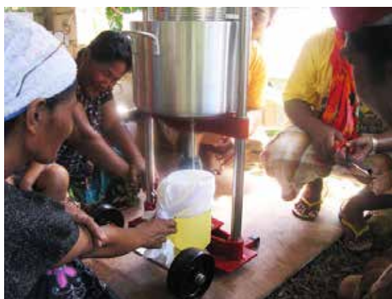
Kiribati Organic Producers making organic products

labourers in their neighbourhood, and developing a glass crushing business is a viable option. These motivational differences mean that the two businesses may make very different strategic decisions. For instance, if the demand for construction material changes so that crushing glass for construction products is no longer viable, Business A may consider repurposing recycled glass into other products, but Business B may decide to stop recycling and crushing glass, and look for other options to employ labourers. In this example, Business A is mainly a green business, while Business B is a social enterprise.