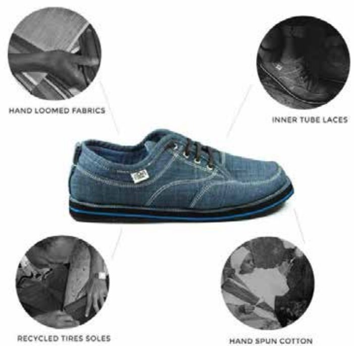
Sole Rebels manufactures shoes from recycled products and describes itself as “Green by Heritage” 33

Sole Rebels 32 is an Ethiopian company that makes shoes from recycled materials.